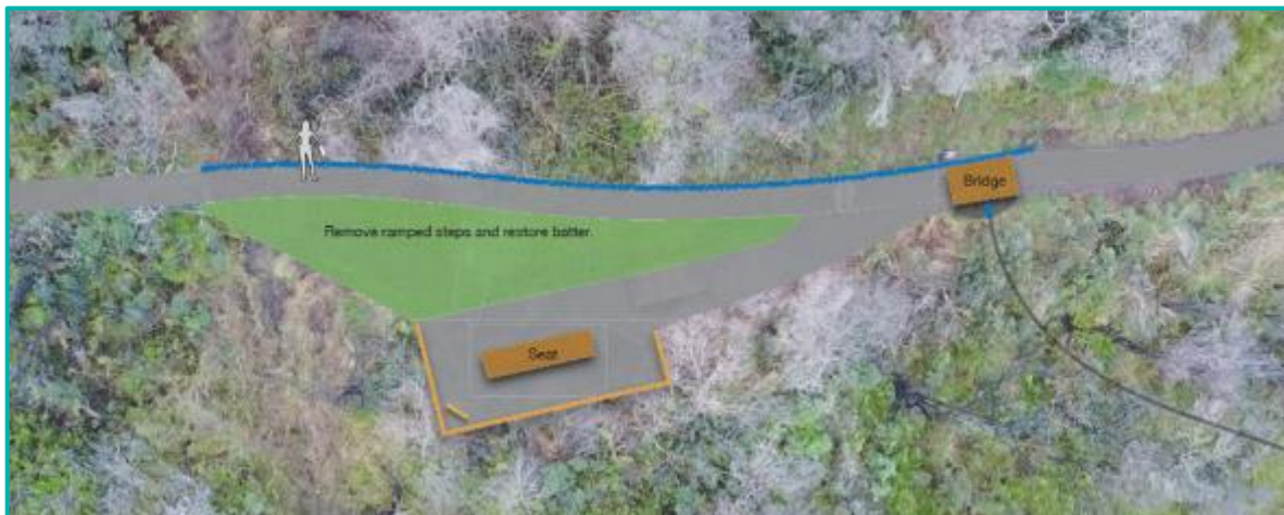
Figure 1 (above) and Figure 2 (below): Paddy's Path realignment and new lookout

Following community feedback on ramped steps installed through the recovery program last year, a section of track in the middle of Paddy's Path will be diverted. The ramped steps at the Separation Creek end will also be removed and steps that meet Australian walking track standards installed. Works will begin once all approvals have been acquired.