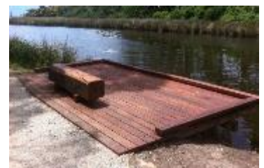
Figure 5: Example of riverbank platform